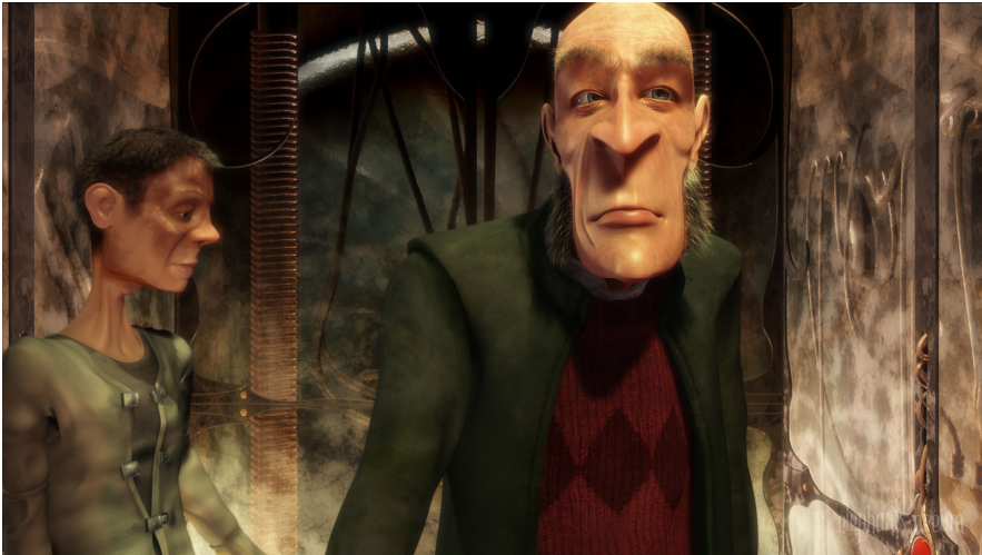
Picture 1: A scene from Elephants Dream animated movie from 2006. It showed that Blender and other open source tools can match visual quality with the commercial solutions in the field of 3D animation.

in this paper, which does not aim to make an overview of such artworks but to study the alterations which open source makes in comprehension of artwork itself, the new options it enables, as well as to discuss those tendencies which are inherent to art and which potentate art for a new development in the open source environment.